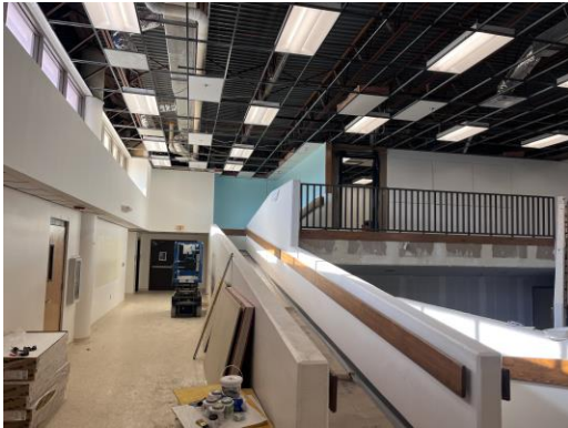
VIEW OF COMMON ROOM 101