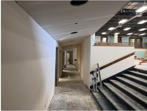
VIEW OF DRYWALL FINISHING