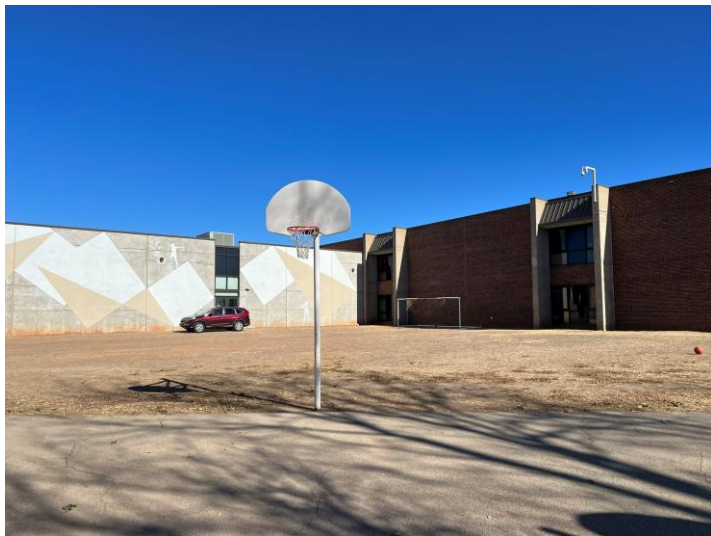
MULTIPURPOSE PLAYING FIELD (before)