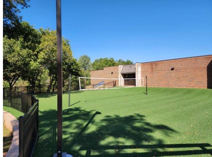
VOLLEYBALL ACTIVITY AREA (new)