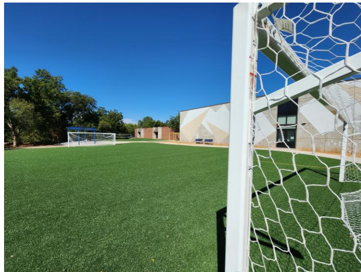
MULTIPURPOSE PLAYING FIELD (new)