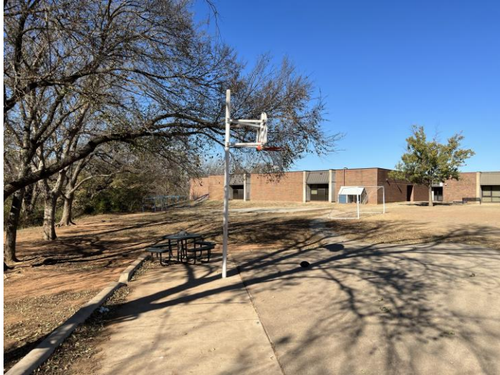
VOLLEYBALL ACTIVITY AREA (before)