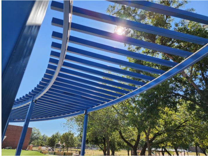
PERGOLA ACTIVITY AREA