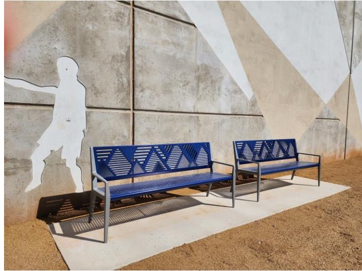
STUDENT BENCH SEATING